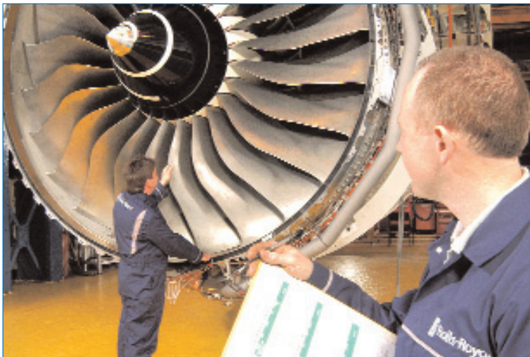
Figure 1: DAME will use Grid technology to deliver diagnostic support to remote engine maintenance crew.

The research challenges which will be faced include real-time intelligent feature extraction, intelligent data mining, and application of decision support techniques, where expertise and software tools are distributed across the Grid. The large databases and the need for distributed access to