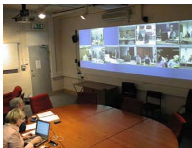
Figure 3: Collaboration over Access Grid